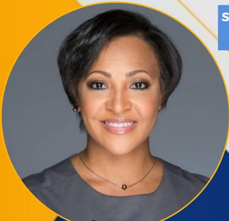
Latrina Pope Redlined, inc.