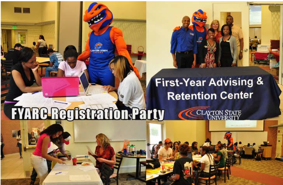
The First-Year Advising & Retention Center hosted a registration party in Laker Hall to help freshmen get registered for their next semester of classes.