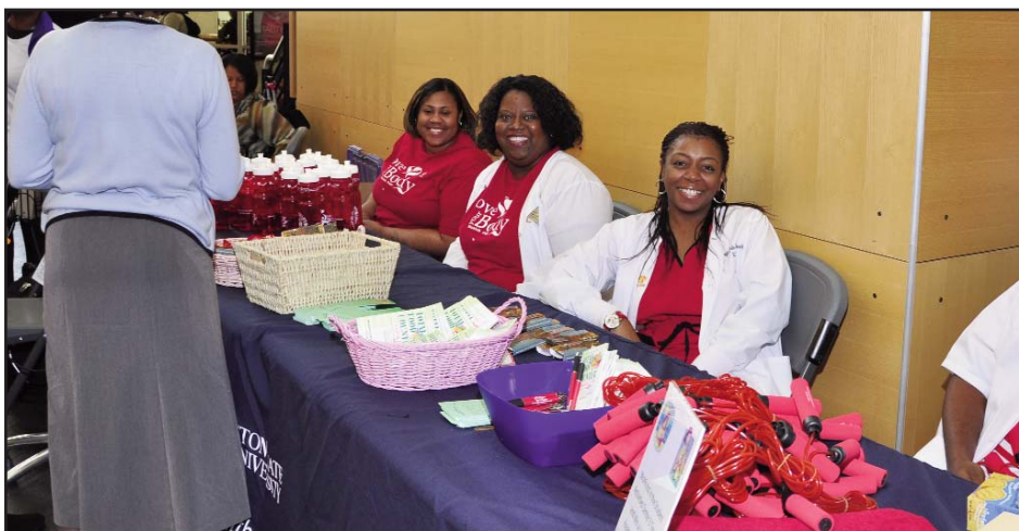
University Health Services hosted the annual Love Your Body fair on Main Street in the James M. Baker University Center on Mar. 18. The Clayton State campus had the opportunity to learn about healthy living while receiving give-aways.