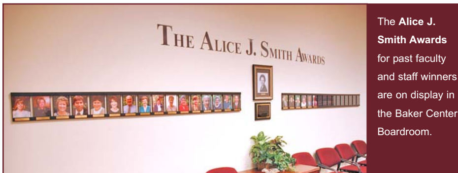
The Alice J. Smith Awards for past faculty and staff winners are on display in the Baker Center Boardroom.