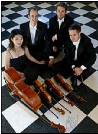
the Degas String Quartet