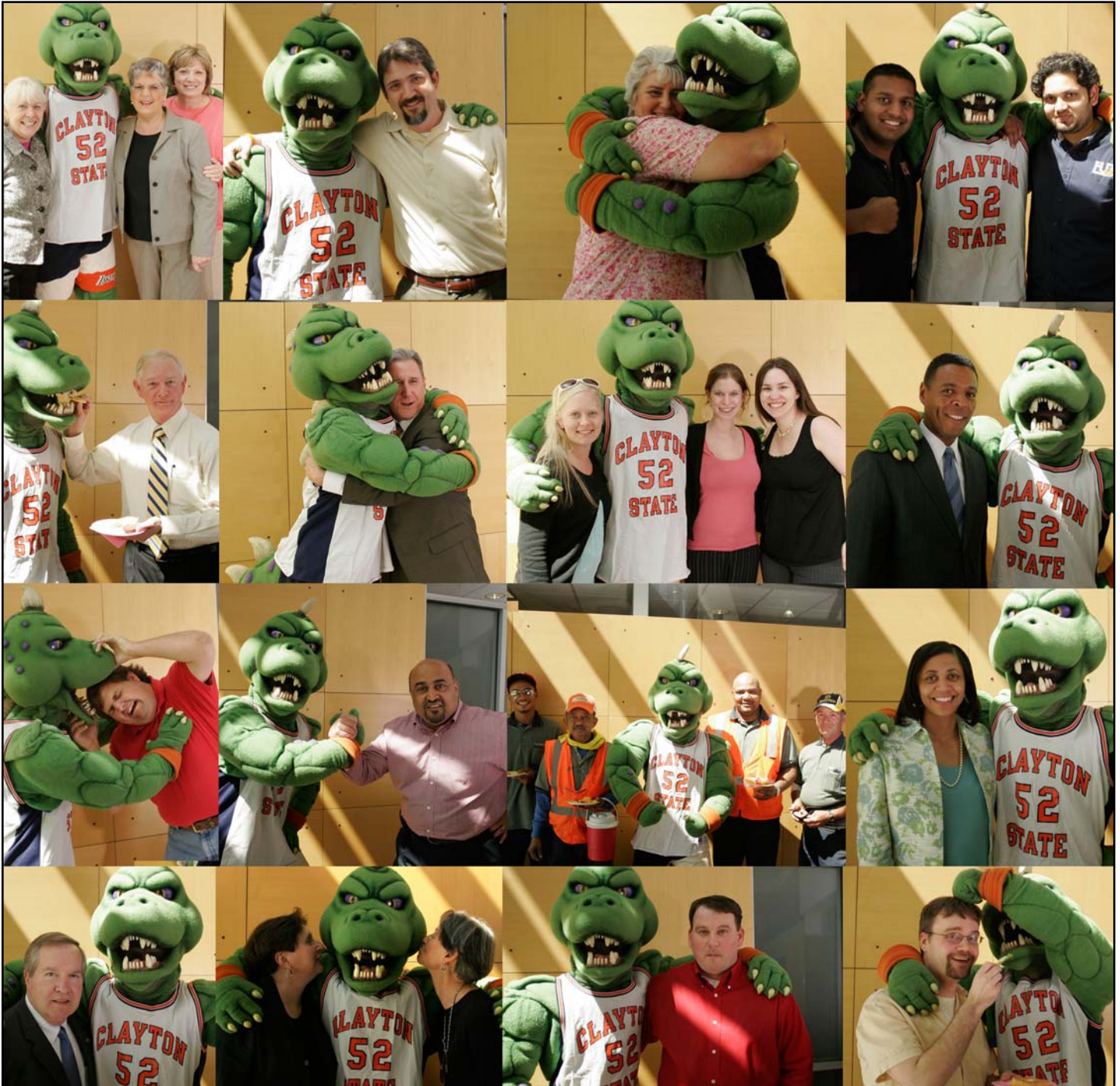
Clayton State University faculty and staff were invited to have their pictures taken with Loch at the Apr. 17 Campus Connect in the James M. Baker University Center. If you had your photo taken or would like to see photos of fellow faculty and staff, access the University's Z Drive Campus Shared Photos folder and browse through the folder named Campus Connect Spring 2008 Loch Pictures.

State colleagues. "You represent the largest group of faculty ever selected from Clayton State to teach in European Council programs, and it was my pleasure to endorse all of your applications and speak on your behalf last Friday." ■