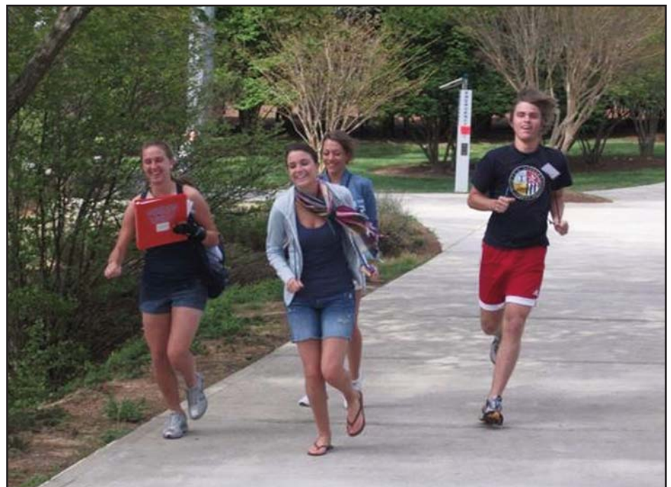
One of 14 teams participating in CIMS' version of "The Amazing Race" hurries toward the James M. Baker University Center.

gram... you would head to see the Registrar. ■