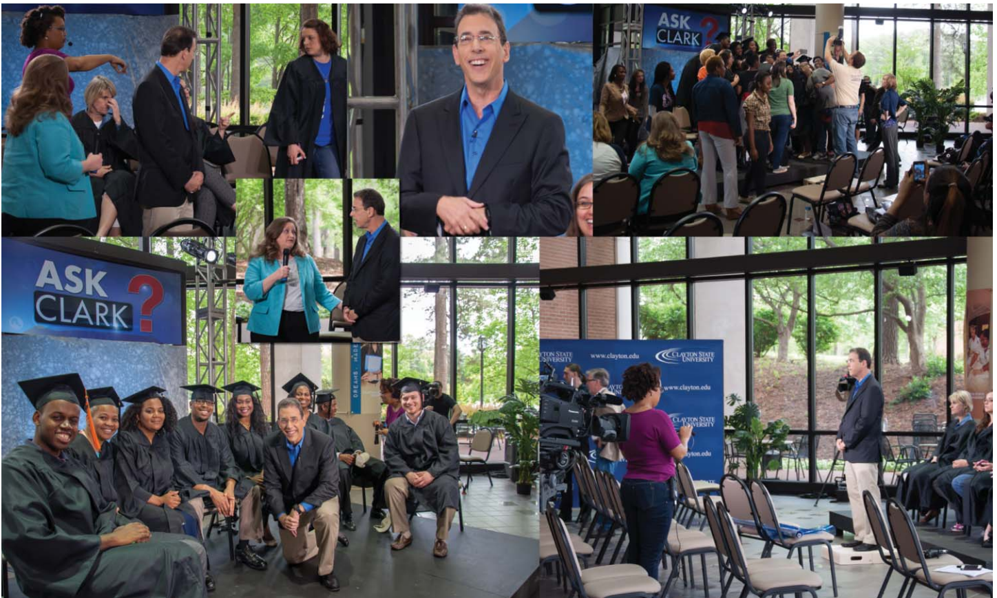
Clark Howard and crew filmed a commencement-related episode of "Ask Clark" on the Clayton State main campus.