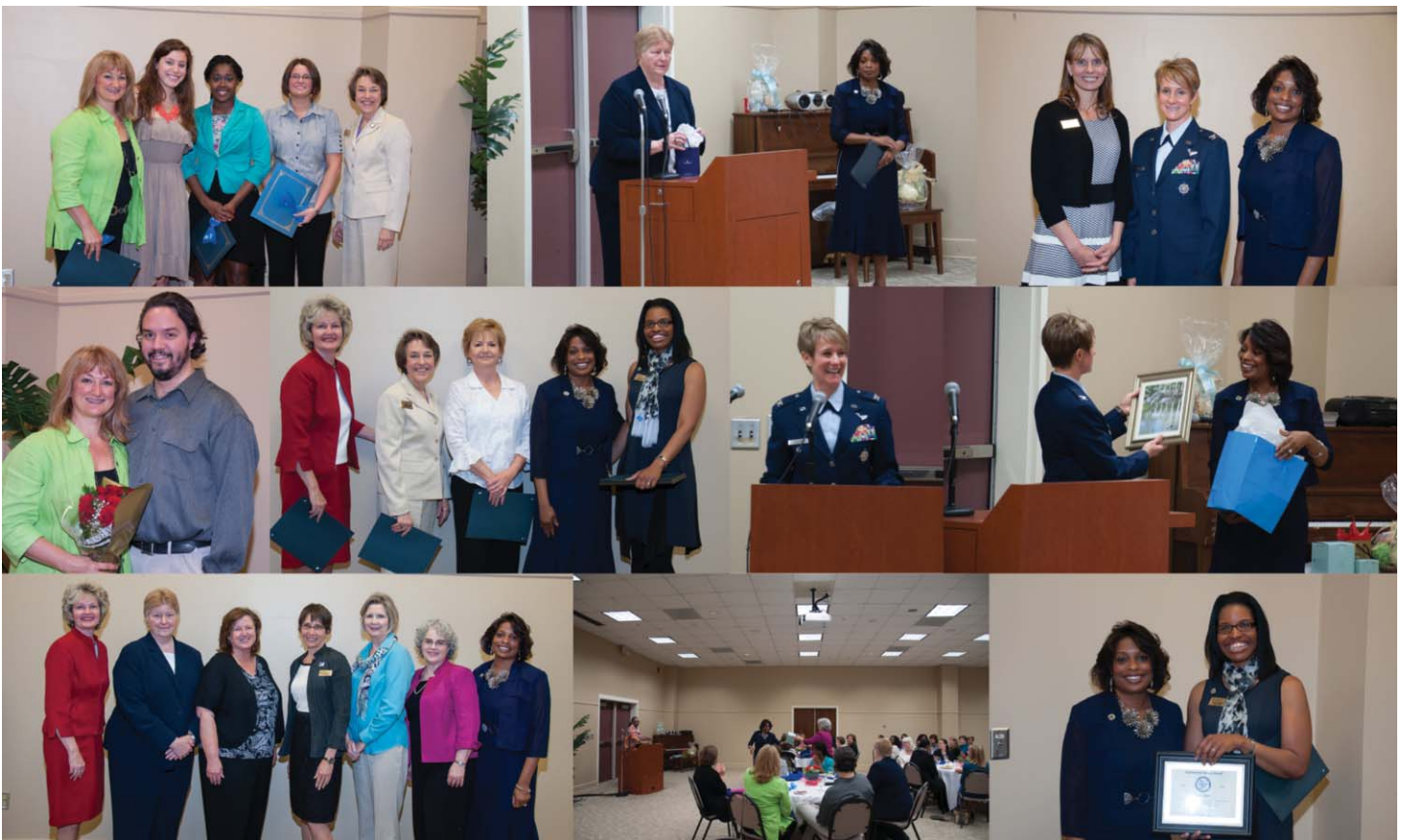
Women's Forum welcomed Colonel Angelique L. Faulise U.S. Air Force (Retired) on April 22.