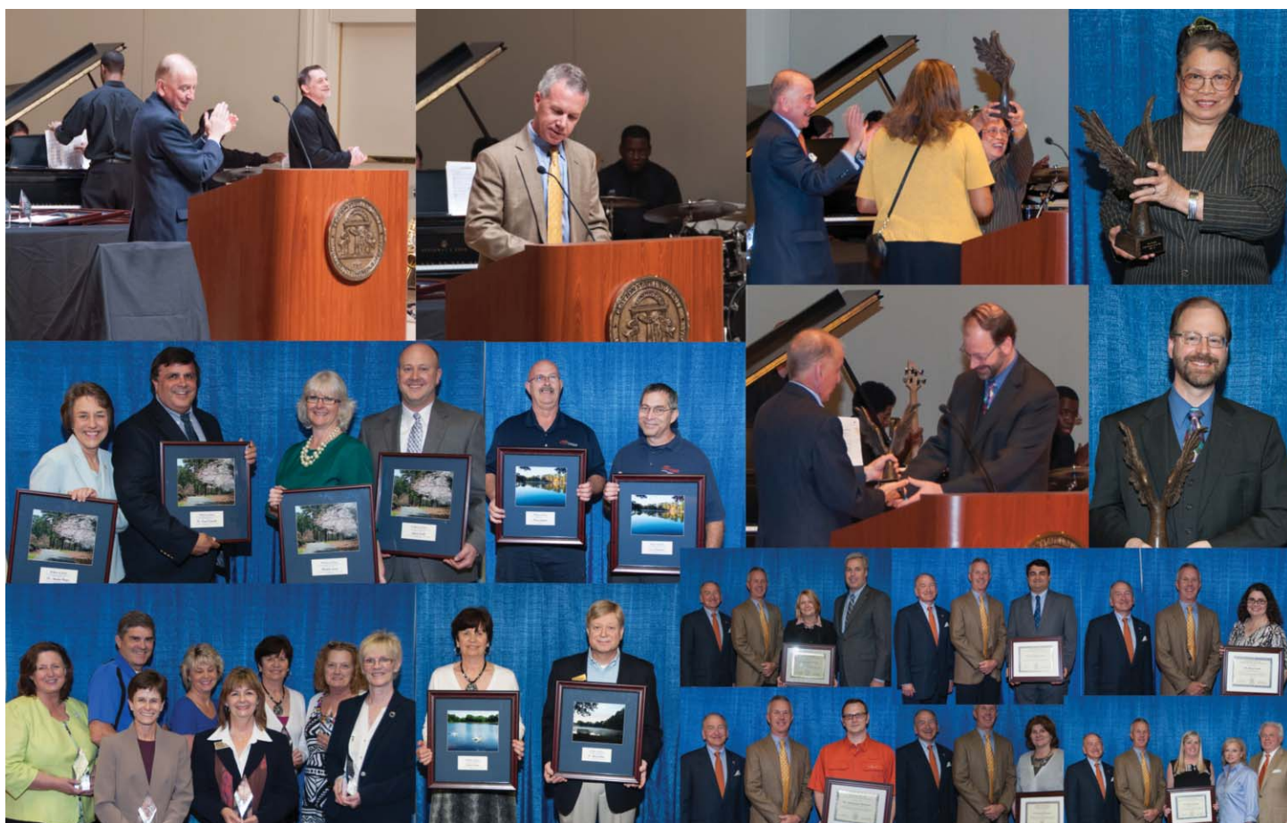
Smith Awards and Service Awards 2014