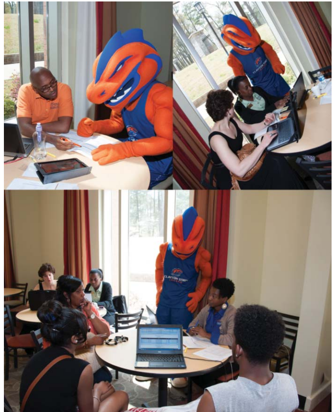
FYARC holds a registration party in Laker Hall