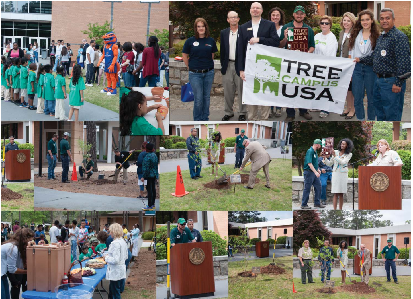
Arbor Day Celebration and tree planting 2014

The Arbor Day Foundation is a million-member nonprofit conservation and education organization with the mission to inspire people to plant, nurture, and celebrate trees. More information is available at www.arborday.org . ■