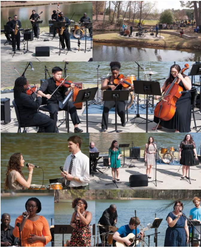
CMEA, NAFME Student Chapter, and The Department of Visual & Performing Arts presented a Music Showcase featuring Clayton State music students and the Clayton State Jazz Combo.