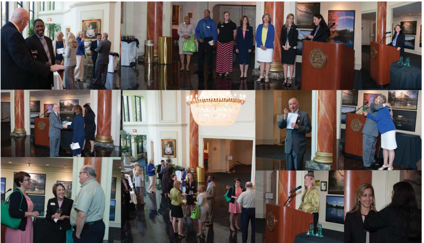
The Alumni Association inducts new members in a ceremony held in Spivey Hall.